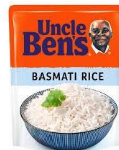
Long Grain Rice