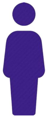
Single Person 55%

Anyone who has been given a Food Voucher can use a Food Bank. They can be given by doctors, social workers, some teachers, people at Citizens Advice and people at the Job Centre.