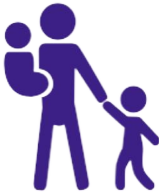
Single Parent 17%