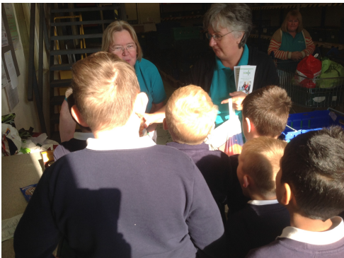
Pupils and Staff from Elleray Park School recently visited the Foodbank Warehouse